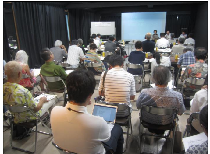
The 17 th annual meeting of Japanese Citizens' Network of Museums for Peace in Naha, Okinawa

of its office to Kyoto Museum for World Peace. I distributed 18 pages of materials to the audience and passionately appealed to join INMP. We have about 60 INMP members in Japan now, and I am aiming to increase the members to 100 for the time being.