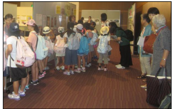
Children listening to their teacher

every day in the extremely hot weather including many young children as shown below..