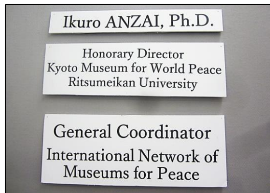
Signs of secretariat of INMP