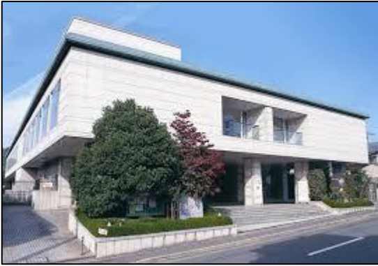
Kyoto Museum for World Peace

According to the decision of the INMP board, the secretariat office is now being relocated from The Hague to Kyoto Museum for World Peace.