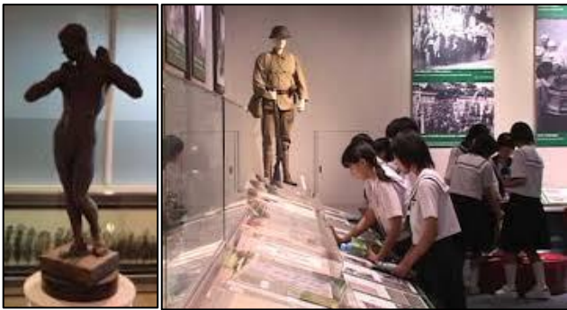
left: Wadatsumi Statue, a symbol of students who fell on the battlefield