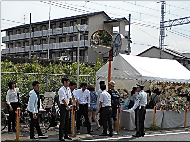
A flower donation place for memorials set up a little away

The 62 nd investigation of Fukushima Project was made on July 7-8, 2019