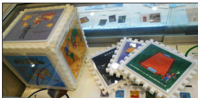
Dice developed for peace education. Statistical data on peace is illustrated on each side. Easy to assemble.

Nori-ben is a box of rice with a layer of seaweed on top with an egg omelette, grilled salmon and simmered taro and carrot as a side dish.