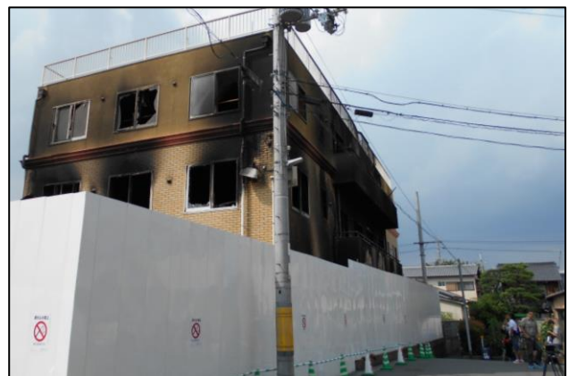
Ruin of Kyoto Animation Company

The company is located at Uji where I live. I visited the scene of the tragic incident on July 23 rd on my way back home from the Kyoto Museum for World Peace in the northern part of Kyoto City. Burnt charred building wall was telling the misery of the incident. According to a company official, all original drawings and valuable materials became ashes.