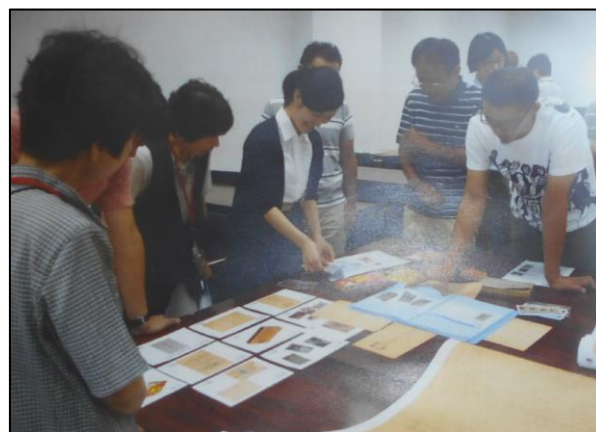
A staff explaining to the teachers about the loan materials.