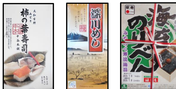
Kakinoha-zushi (Kyoto) Fukagawa-meshi (Tokyo) Nori-ben (Fukushima)

It takes about 5 hours to reach Fukushima from the nearest station of my house in Uji City. I enjoy my favorite lunch boxes on the way.