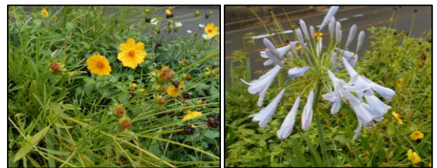
Flowers on the way from the nearest subway station to the Nakamura Candle Store

The Project Team made its 62 nd visit to Fukushima on July 7 to convey this hopeful information on how to use degraded perilla oil and is now planning to make its 63 rd visit around July 20 when farmers are going to plant perilla seedlings in the field.