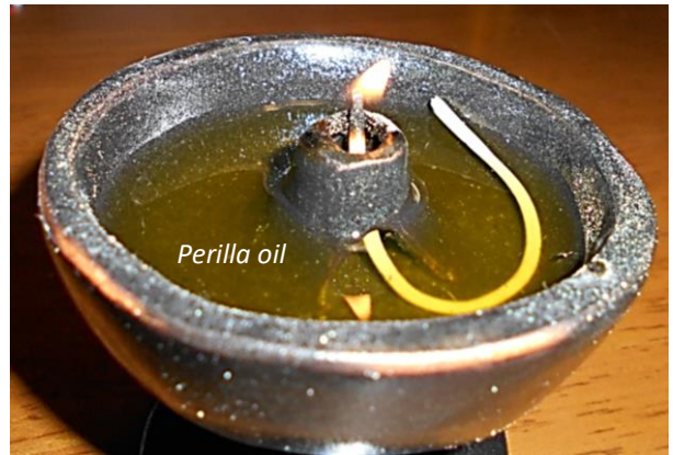
This special container for votive lighting is called “Tankoro”

Mr. Tagawa first demonstrated that degraded perilla oil can be used as a votive light as shown in the photo below.